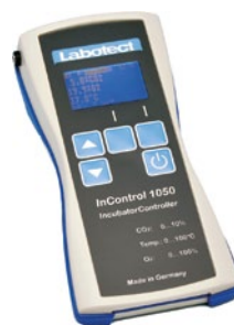
InControl 1050 Labotect GmbH