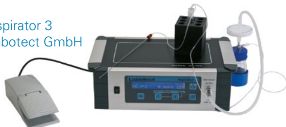
Aspirator 3 Labotect GmbH