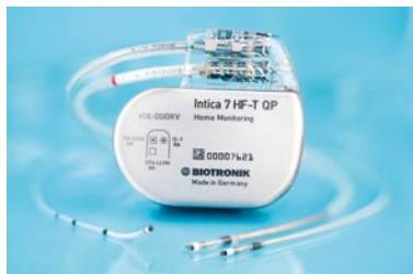
Neues CRTD Implantat Intica 7 HF-T QP von Biotronik